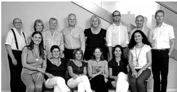
The ETI team

Member of CLARET GROUP learn • grow • achieve •