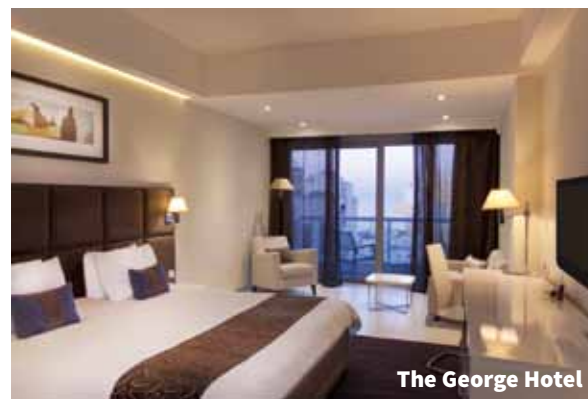
The George Hotel

The George Urban Boutique Hotel is located across the street from ETI. The George is an “urban boutique” hotel offering large, comfortable and chic rooms.