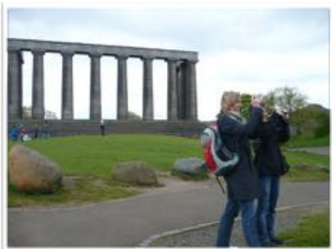
Practise your English while visiting Edinburgh with your teacher

Individual Tuition courses focus 100% on your specific needs and requests.