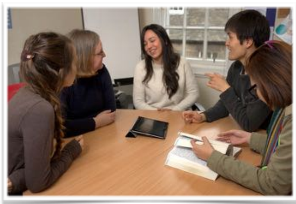
Courses available to start any Monday

General English group courses are available for all levels from beginner to advanced