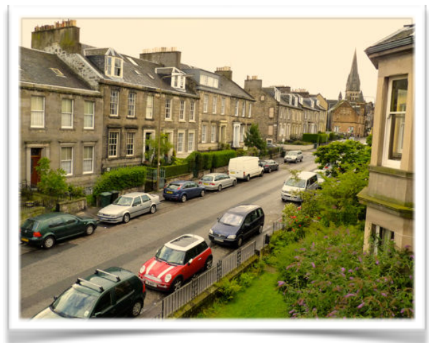
Example location of homestay accommodation

We advise early booking for July & August