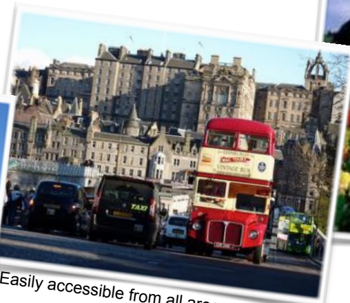
Easily accessible from all areas of the city