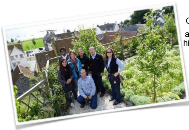
Culross Village, a well preserved historic village by the sea

Glenkinchie Whisky Distillery, Falkland Palace and village, John Muir's birthplace and Dunbar, Culross Village, Stirling Castle, New Lanark, Tantallon Castle, Hopetoun House, Britannia, Museum of Flight, Traquair House & Gardens, Holyrood Palace.