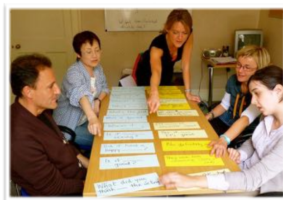
Use English for traveling, socialising and working

Gain confidence to use English for traveling, socialising, and working, or for reading, watching and listening to authentic material in English with ease.