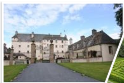
Traquair House and Gardens. The oldest inhabited house in Scotland