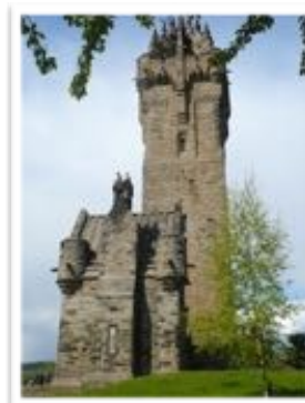
The William Wallace monument