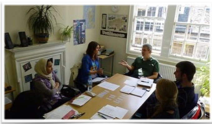
Improve your speaking skills in a small group

General English courses have a guaranteed maximum of 5 students per group.