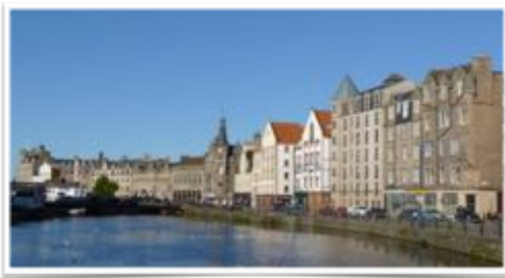
Learn English in the morning and visit Edinburgh in the afternoon

The afternoons are free for you to explore the city on your own or take part in optional activities arranged by ECS Scotland. Whisky tasting, a Scottish cookery course, a historical and scenic walk, visit the Royal Yacht Britannia, Edinburgh Castle or go shopping.