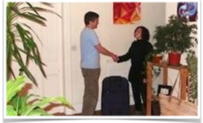
A friendly Scottish welcome

ECS Scotland arranges homestay accommodation for students studying at the school. Staying with a native speaker host enables you to spend as much time as possible speaking English outside the classroom . Living with a local person also gives you an insight into British and Scottish culture .