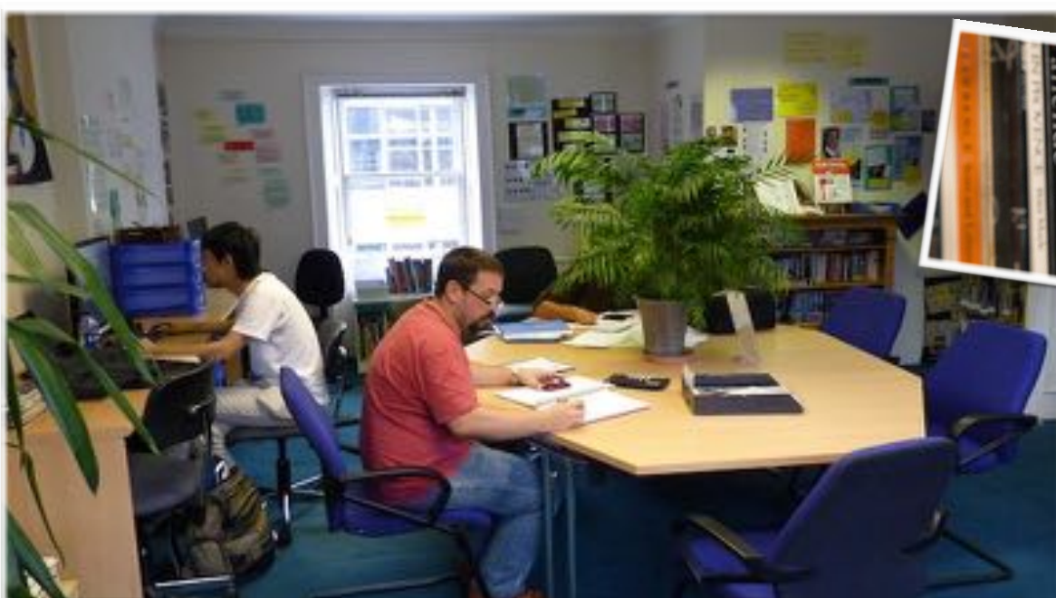
Self-study area. Take advantage of extra listening, reading and grammar material.

We encourage all students to use the resources available to consolidate what is learnt in the classroom .