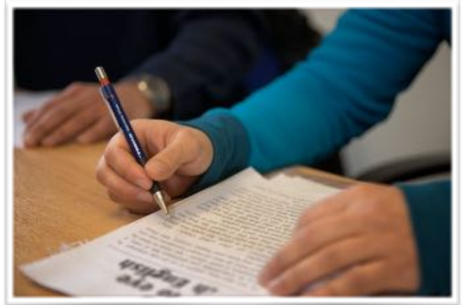
Improve your Academic English before starting university

Intensive Academic English courses are available throughout the year as a Combination Course for students who require assistance with proof-reading their written work, or help preparing a presentation or project in English.