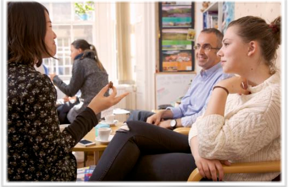
Communicate effectively outside the classroom

You will carry out discussion, problem-solving and presentations in small groups as well as learn about issues such as cross-cultural theory , stereotypes and how it effects our communication. See website for course