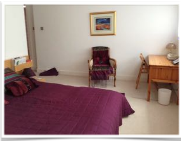
Example bedroom in homestay

Homestay accommodation is provided in comfortable and conveniently located homes all over Edinburgh .