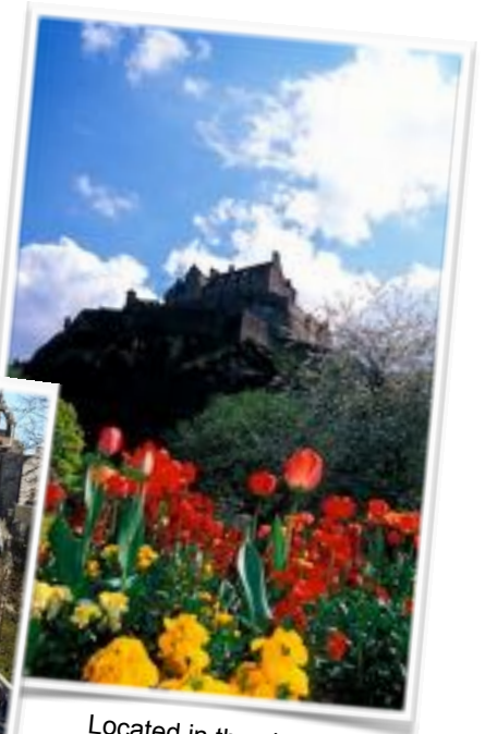
Located in the city centre