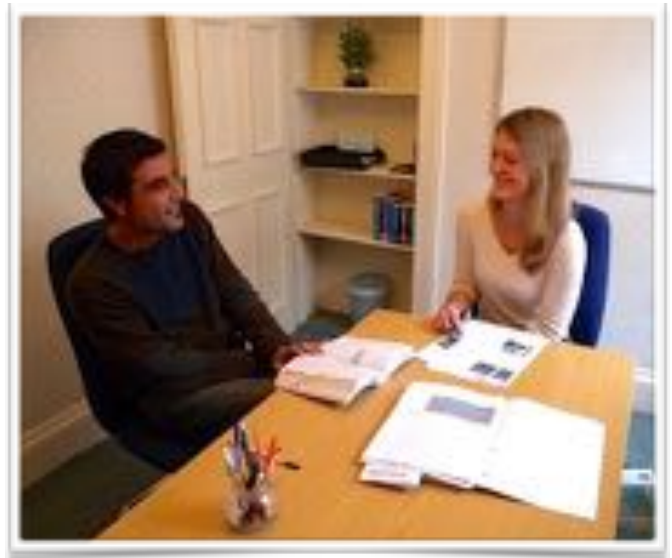
Focus on exactly what you want to learn

During some of your 1-to-1 lessons you can choose to go to a museum, gallery, attraction or walk around the botanical gardens or Old Town.