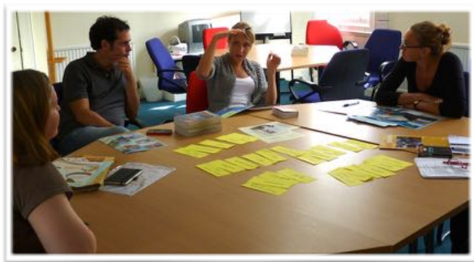
Refresh your English and enjoy a weekend in Edinburgh

Our Weekend Refresher Course gives you the opportunity to refresh your spoken English language skills whilst enjoying a weekend or long-weekend holiday in Edinburgh .