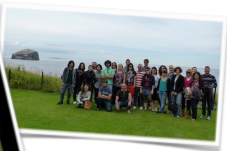
Tantallon Castle with views of the Bass Rock