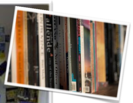
Borrow books and DVDs