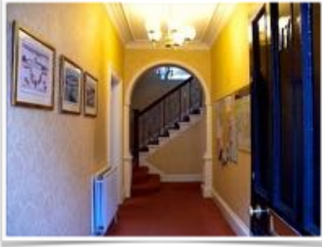
Welcome to ECS Scotland

ECS Scotland is a family-run, British Council accredited English language school founded in Edinburgh in 1995.