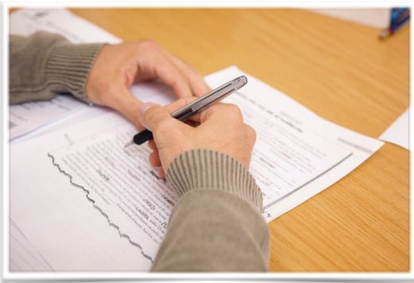
Intensive exam preparation courses available all year

Exam preparation courses are available as Combination Courses and Individual Tuition courses throughout the year.