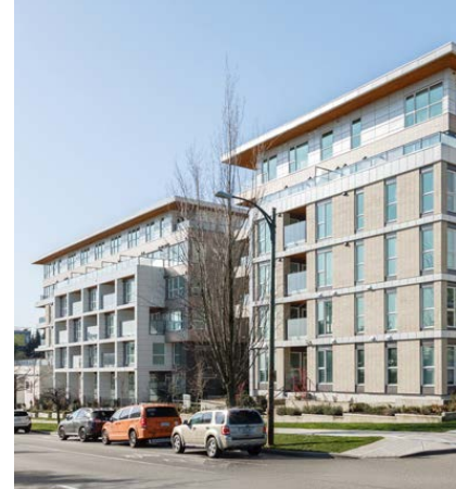
▲ GEC - Student Residences - Vancouver and Burnaby, BC

Transfer prices can include up to 2 people per vehicle - same flight & address