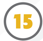
15 Minute walk from city centre

Also included: Cafeteria, dance hall, garden terrace