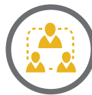
24/7 Help Line