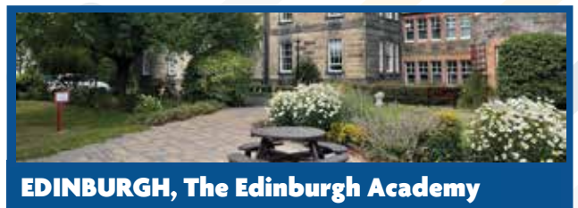
EDINBURGH, The Edinburgh Academy