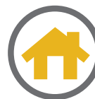
Private room with en-suite bathroom. Full board (Breakfast, Packed Lunch, Dinner)

More Info: Full board - Shared room in carefully selected homestay accommodation. Average distance from homestay is around 3km.