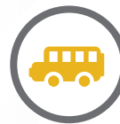
40 minutes from school by public transport