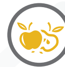
Full board homestay and residential options are available