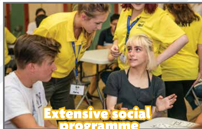
Extensive social programme