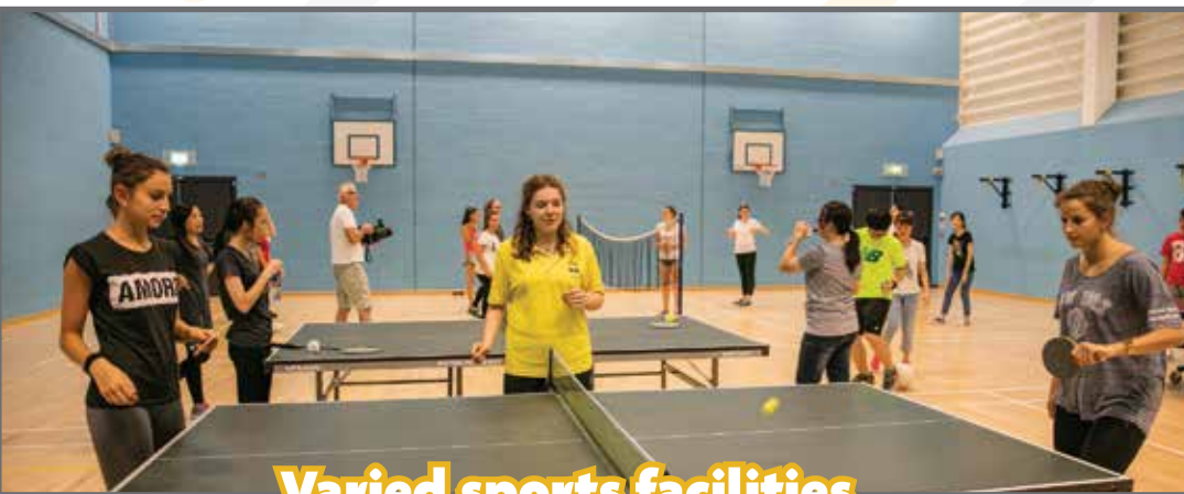
Varied sports facilities