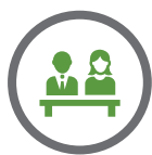
bright & spacious classrooms