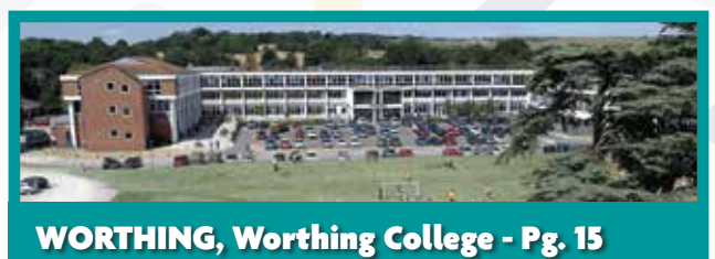
WORTHING, Worthing College - Pg. 15

Disclaimer: The contents of this brochure are intended for information only and shall not be deemed to constitute a contract between Centre of English Studies and an applicant or any third party. While every effort is made to ensure the accuracy of the information, CES reserves the right to make changes affecting policies, courses, fees, curriculum, or any other matters announced in this publication without prior notice. Students should keep informed as to the conditions and regulations applicable to their particular situation at any given time.