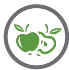
Full board accommodation: Breakfast, packed lunch, and dinner