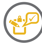
All homestays are carefully selected and visited