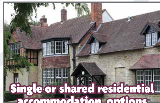
Single or shared residential accommodation options