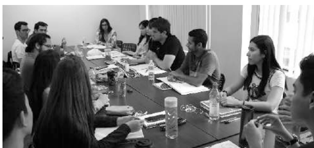
Conversation & Discussion & Debate