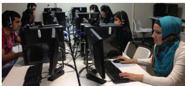
Pronunciation / Intonation