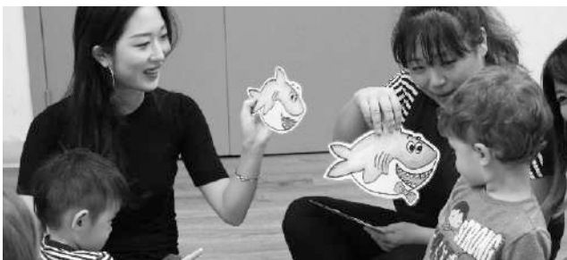
Expands Thinking & Imaginations