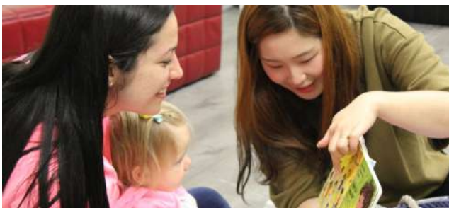
Improves Communication Skills