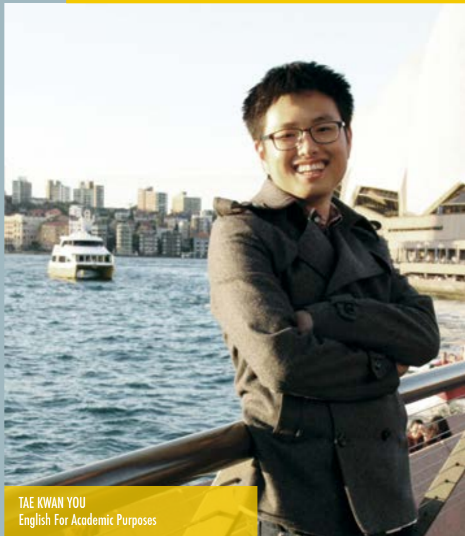
TAE KWAN YOU English For Academic Purposes

(Pre-EAP, EAP1 and EAP2) (Intermediate to Advanced) (10 to 30 weeks)